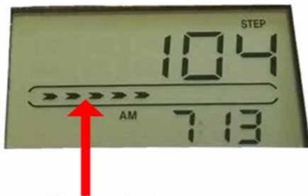
Step Target Alert Progress Bar

The step target alert feature tells you how close you are to your step count goal. A dashed line advances across the screen from left to right, displaying your real-time progress. Once you reach your target for the day, the display will flash.